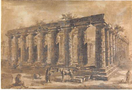
Giovanni Battista Piranesi (1720-1778) Paestum, Italy: Exterior of the Basilica c. 1777-78, Pencil, brown and gray washes, pen and ink on paper, 18 3/4 x 27 1/8 in. Sir John Soane's Museum, London; SM P71 For a larger view, see this magazine's Frontispiece on page 3.