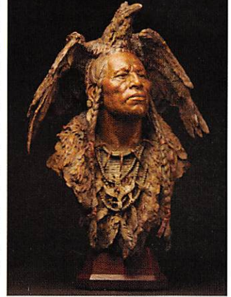
John Coleman (b. 1949) Two Ravens (Edition of 20) 2014, Bronze, 29 x 20 x 14 in. On view at The Western Spirit: Scottsdale's Museum of the West

Information: 3830 N. Marshall Way, Scottsdale, AZ 85251, 480.686.9539, scottsdalemuseumwest.org