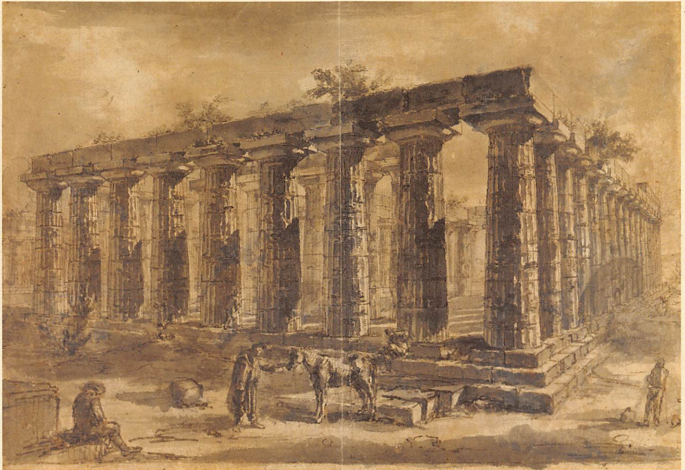
GIOVANNI BATTISTA PIRANESI (1720-1778), PAESTUM, ITALY: EXTERIOR OF THE BASILICA , c. 1777-78. PENCIL, BROWN AND GRAY WASHES, AND PEN AND INK ON PAPER, 18 3/4 x 27 1/8 in., SIR JOHN SOANE'S MUSEUM, LONDON; SM P71; ON VIEW IN THE EXHIBITION PIRANESI AND THE TEMPLES OF PAESTUM: DRAWINGS FROM SIR JOHN SOANE'S MUSEUM AT NEW YORK CITY'S MORGAN LIBRARY & MUSEUM (THEMORGAN.ORG) JANUARY 23-MAY 17; FOR DETAILS, SEE PAGE 106.